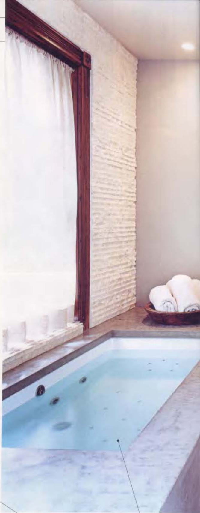
Curtain wall Made by Beckenstein Fabric & Interiors, it can be pulled to close off the lounge/dressing area.

THE SOLUTION A deep soaking tub, a fireplace, and a microfiber drape that can separate the space into a dressing room, bathroom, and bedroom. When the parents want privacy, they draw the curtain. "One takes a soak while the other reads," says Clodagh.