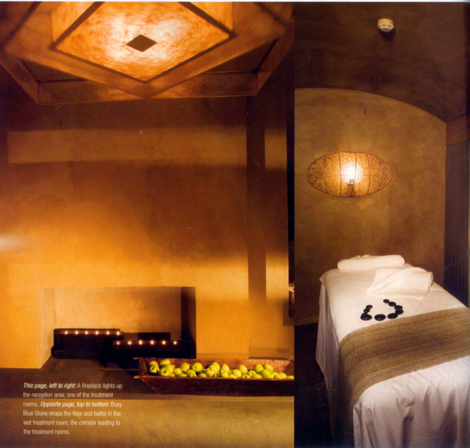
This page, left to right: A fireplace lights up the reception area; one of the treatment rooms. Opposite page, top to bottom: Buxy Blue Stone wraps the floor and baths in the wet treatment room; the corridor leading to the treatment rooms.

To further enhance the calming atmosphere, the space is filled with diverse and soothing lighting. Rotating fixtures by Pagani Studios and local artisan Leo Scarff brighten hallways and treatment rooms, while sunlight shines through five slits in a door near reception to create intrigue for waiting guests. And although Clodagh could not incorporate a fireplace into the design, troughs and LED candles gleam in the corridor and wet treatment rooms. “I love working on spas because it can change the world,” she says. “You go in with spiky energy and come out pink and glowing.” hd