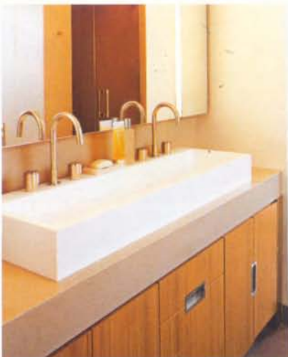
The Caledonia master bath by Clodagh