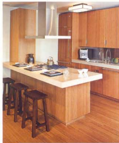
The Caledonia kitchen by Clodagh